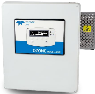
Figure 1: Model 480L Ozone Monitor

Ozone gas is used for cleaning, purifying and other purposes in many industrial hygiene applications. At low levels, ozone gas is harmless and present in the air we breathe every day. At higher levels, ozone can negatively affect human health. Protecting people in the workplace is always a top priority, so monitoring ozone applications for leaks is imperative. The preferred method of monitoring for harmful ozone exposure is to use the Teledyne API