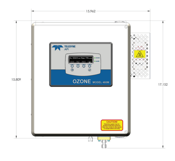
System Dimensions (inches)