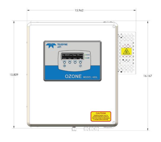
System Dimensions (inches)