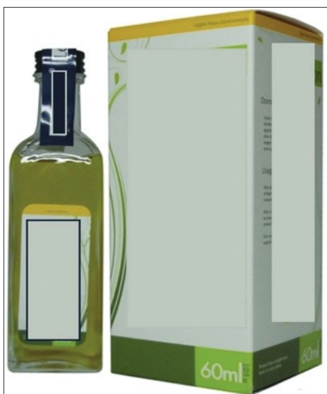
Figure 1: The appearance of one of ozonated oils sold in a web site. The color of the product suggests that it was not ozonated sufficiently

of companies and web sites may be easily found to buy ozonated oil. But, very few of these products are reliable, and contain sufficiently ozonated oil [Figure 1]. If you want to buy a sufficiently ozonated and effective oil, following features should be considered.